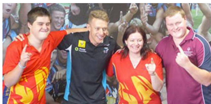
Team South Australia athletes meet players from Port Adelaide AFL team.

As the Games are set to get underway in Melbourne, the spiritual home of AFL, it is fitting to see our AFL friends from afar supporting our Special Olympics Australia teams. The 2014 AFL premiership winners Hawthorn Hawks visited Special Olympics Tasmania athletes to celebrate their win. Click here for photos. In Adelaide, Port Adelaide Power showed their support for Team South Australia. Click here for details.