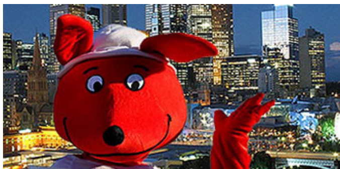
Soey the Joey is in Melbourne and here are some sneak peeks at what she has seen so far.