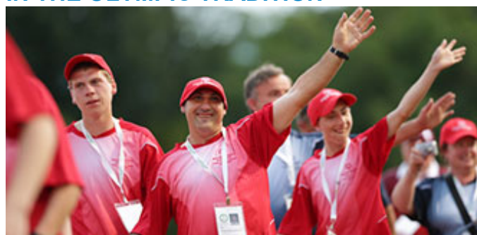
The Parade of Athletes is one of the traditions of the Special Olympics National Games Opening Ceremony.