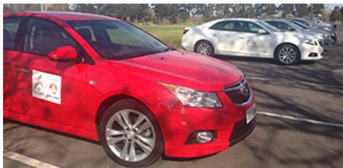
Thanks to Holden there are plenty of vehicles for necessary Games transport.