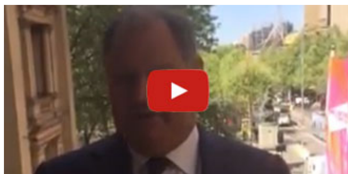
Lord Mayor of the City of Melbourne, Robert Doyle.

While athletes finalise their preparations for the Games lots of our supporters are taking the opportunity to wish them well. Check out the messages of support below. You can also post your own message to the National Games facebook page .