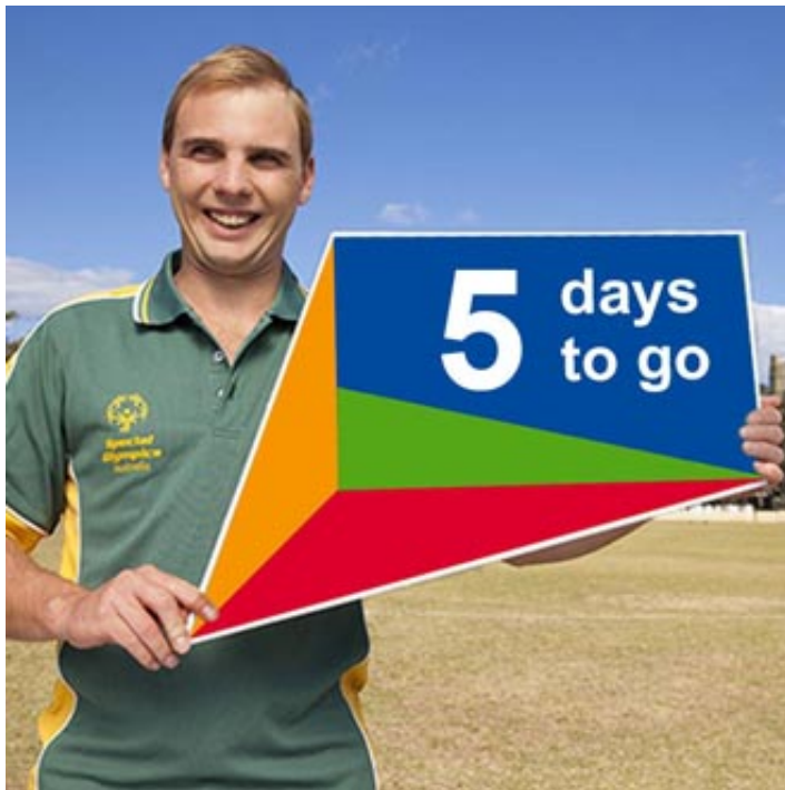
Not long now!