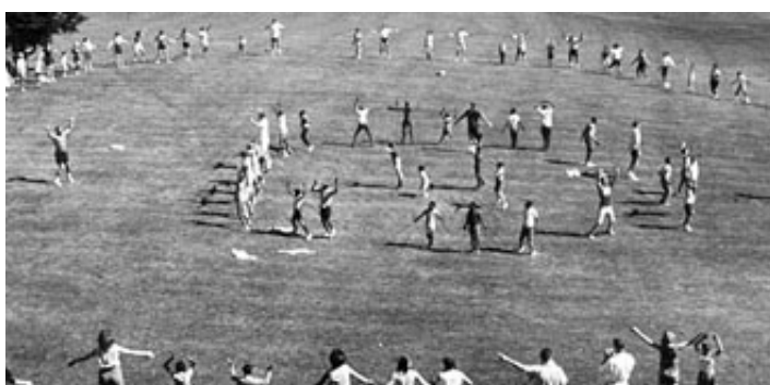
Camp Shriver 1962.

In 1962, Eunice Kennedy Shriver invited 75 children with an intellectual disability to Camp Shriver where she gave them an opportunity to play sport in her own backyard. This was the first important step in the history of Special Olympics which today supports over 4.4 million athletes in 170 countries. Click here to find out more about Eunice Kennedy Shriver and how her sister Rosemary was an inspiration.